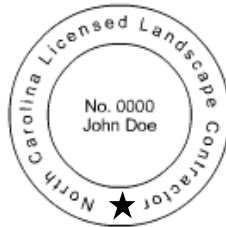
Sample Stamp Seal

(Seal can be ordered from a local or online office supply business)